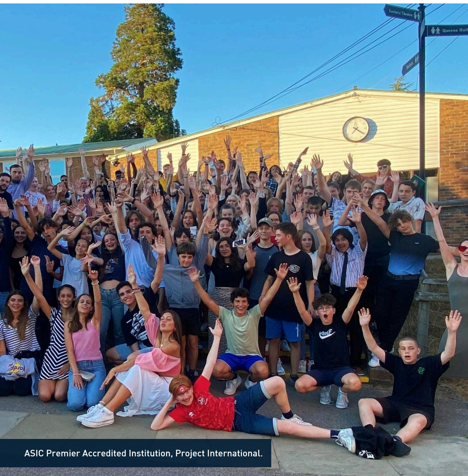
ASIC Premier Accredited Institution, Project International.

ASIC reserves the right to amend its services, processes, and all associated fees at any point as deemed necessary. Changes to accreditation fees and all other associated fees will be communicated to existing ASIC institutions via email and updates to the Finance Policy.