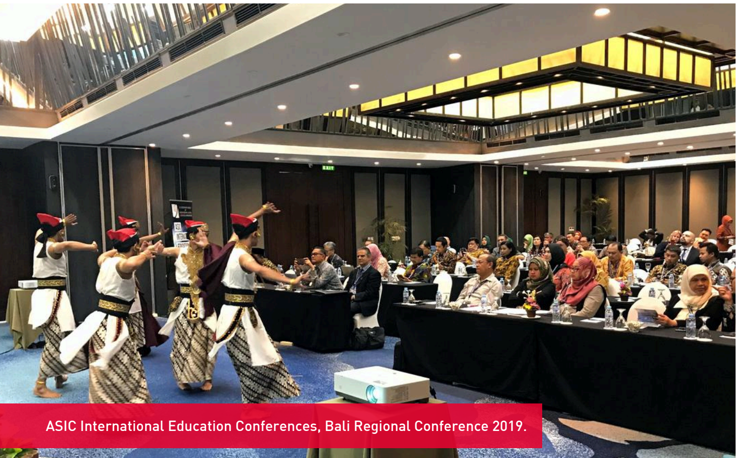
ASIC International Education Conferences, Bali Regional Conference 2019.

Opportunities to further develop your provision are available through supplementary services, e.g. ASIC International Education Conferences and ACS Consultancy (see ASIC website for more). Additional fees will apply to use these services, but we endeavour to offer priority access or provide discounts and other options exclusive to our accredited institutions.