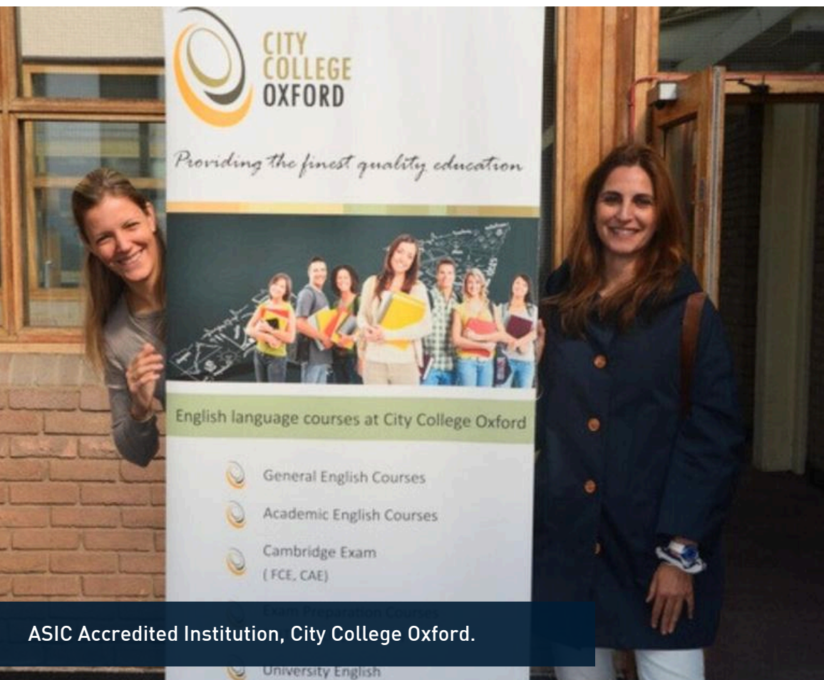
ASIC Accredited Institution, City College Oxford.

[1] Documentation/photographs to demonstrate the institution has made the required improvements. In some cases, the AAC may decide that a further visit to the institution is required to verify the evidence submitted. (There will be a charge for this visit, see the Finance Policy.)