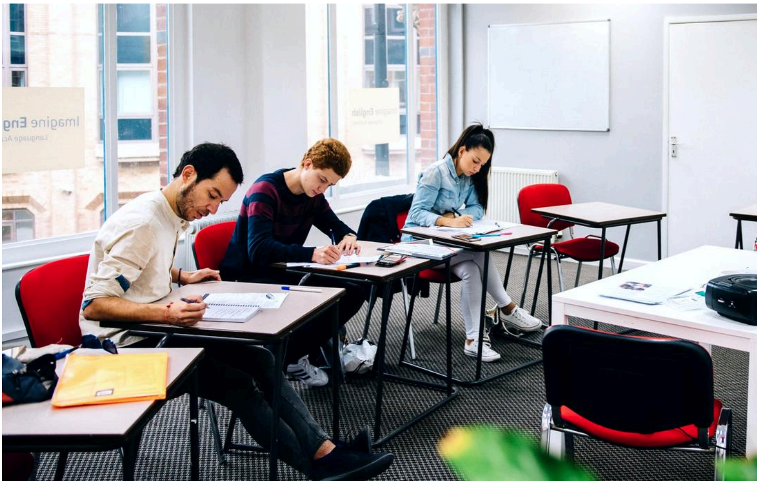
Classroom of ASIC Accredited Institution, Imagine English.

Decision: The process leading to the award of Accreditation for a new institution is as outlined in Section 2.3.2. , and all applicable Fees are in the Finance Policy ( Appendix B ). The Stage 3 Inspection will occur during the Interim Period, once the institution has informed ASIC that the recruitment of students has been successful and classes have begun. When the institution has demonstrated that its full range of provision meets the required standards, the AAC will award full Accreditation, again, as described above in Section 2.3.3.